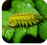
Spiky yellow woodlouse Pseudolaureola atlantica