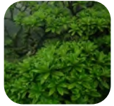
Black cabbage tree Melanodendron integrifolium