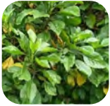
Bastard Gumwood Commidendrum rotundifolium