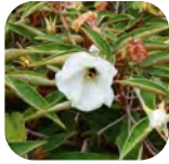
Dwarf ebony Trochetiopsis ebenus