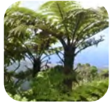
St Helena tree fern Dicksonia arborescens