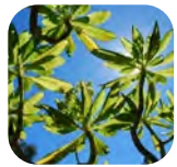
He cabbage tree Pladaroxylon leucadendron