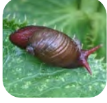
Blushing snail Succinea sanctaehelenae