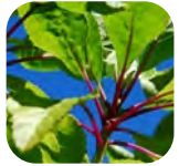
She cabbage tree Lachanodes arborea