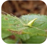
Golden sail spider Argyrodes mellissi