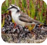
Wirebird Chardrius sanctaehelenae

One of the remotest islands on Earth; an extraordinary place to visit.