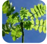
Jellico Berula bracteata