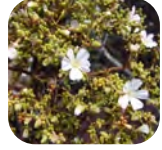
St Helena Tea Plant Frankenia portulacifolia