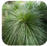
Hair Grass Eragrostis saxatilis