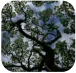
Gumwood Commidendrum robustum