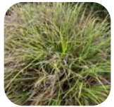
Diana's Peak Grass Carex Dianae