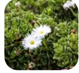
Scrubwood Commidendrum rugosum